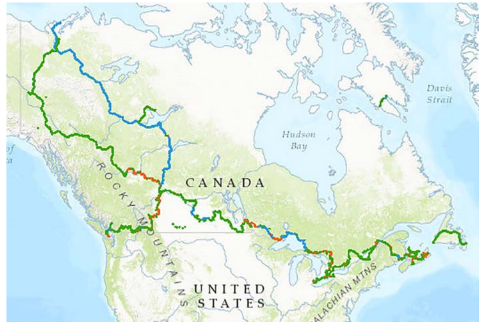
The Great Trail