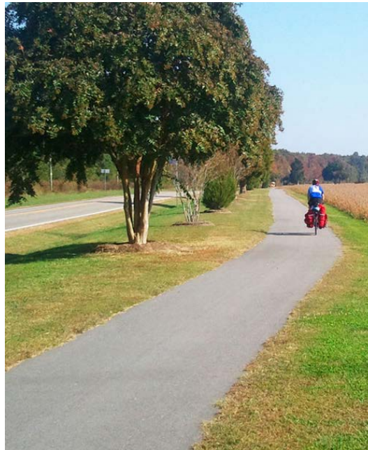
path along road