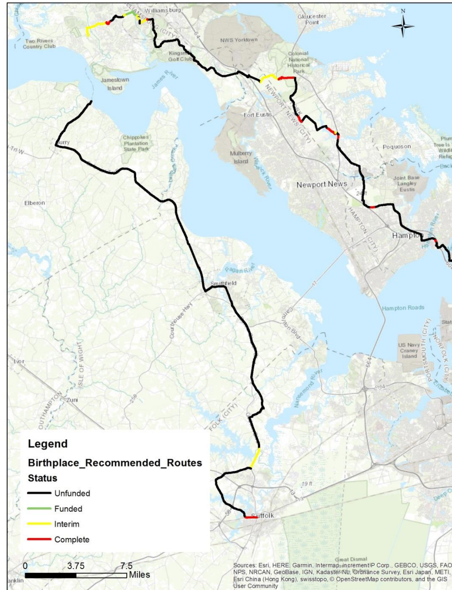
Segments of Birthplace of America Trail