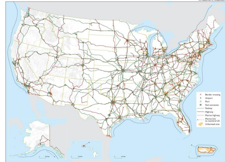
Multimodal Freight Network - Draft Representation

Notes for information on symbology used for feature selection in this map please see U.S. Department of Transportation, National Freight Strategic Plan, Appendix D, 2015.