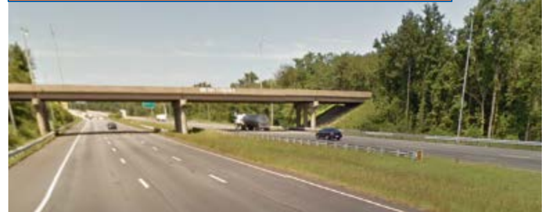
Interstate 464 – Chesapeake