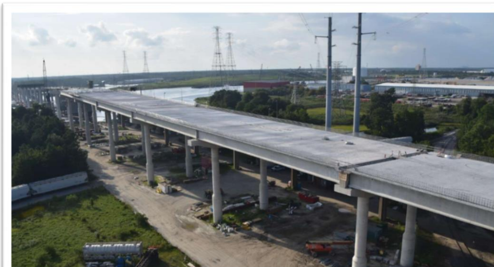
Completed Decks on High Rise Bridge Spans 21-26 (Looking Northwest)