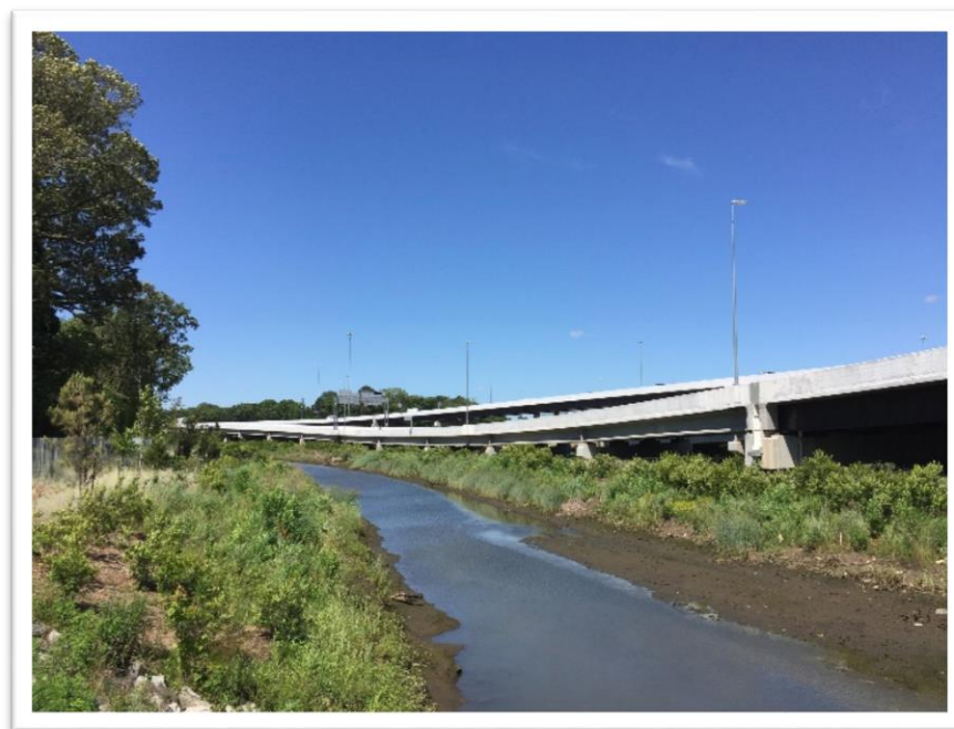
CD Road Bridge, 264 Flyover and Tidal Channel (low tide)