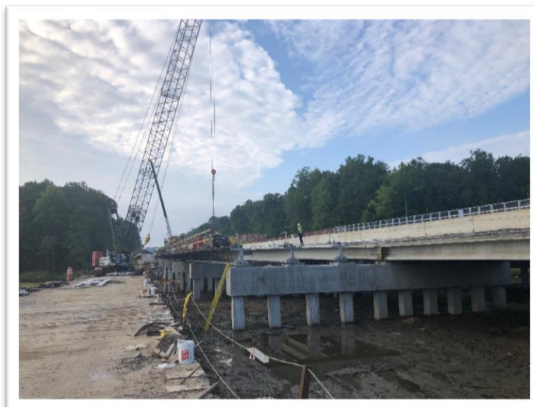
Bridge construction at Westbound Queens Creek