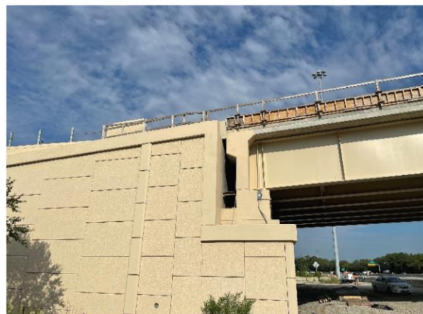
Greenwich Flyover – Coating of Girders and MSE Walls