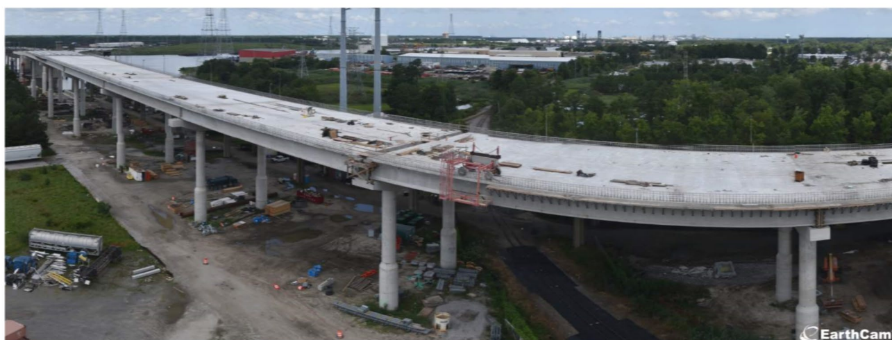
(Panoramic View of High Rise Bridge Looking North)