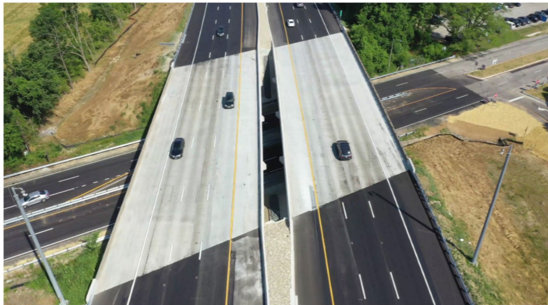
Project Site (Looking West from the Yorktown Road overpass)