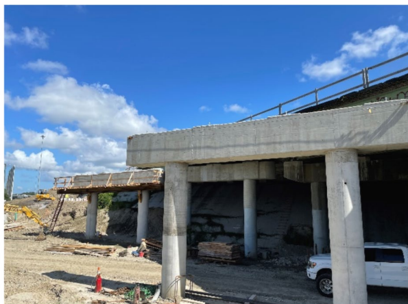
B602 (RR Bridge) Pier Caps Complete