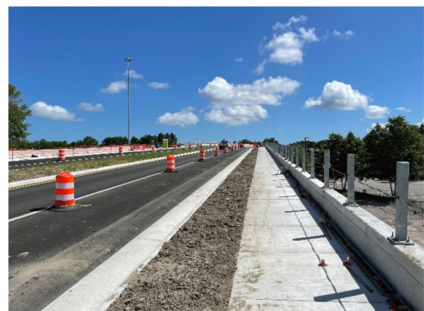
Flyover Approach – East Side Sidewalk