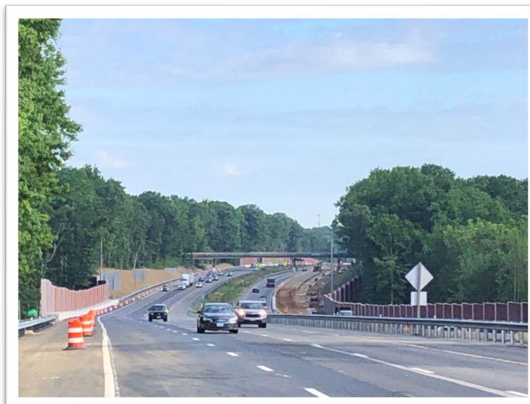
Interim milestone achieved of opening eastbound 3 rd lane after Exit 238