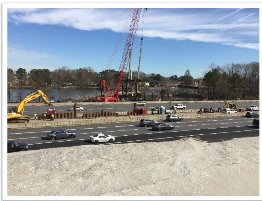
Future B-603 Greenwich Road I-264 Flyover Crossing