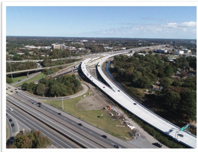
Interchange opened and operational