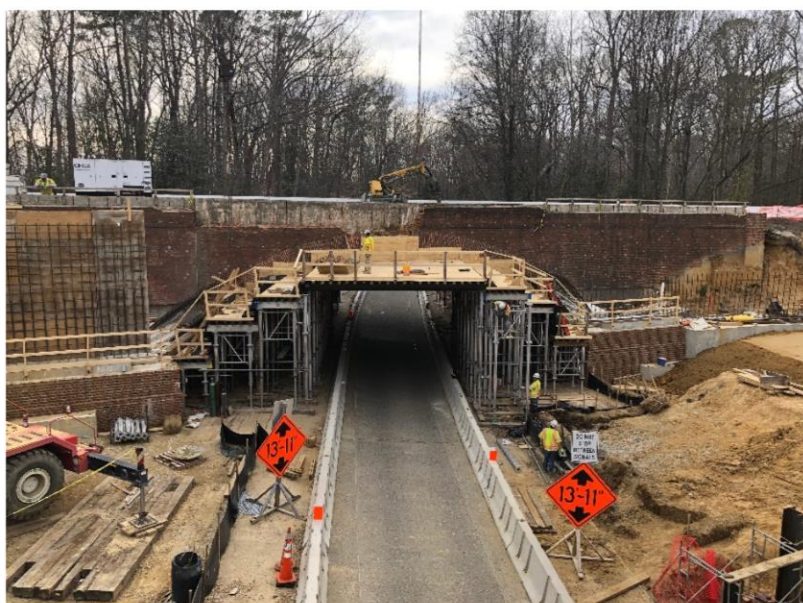
Colonial Parkway Bridge Construction (Looking South)