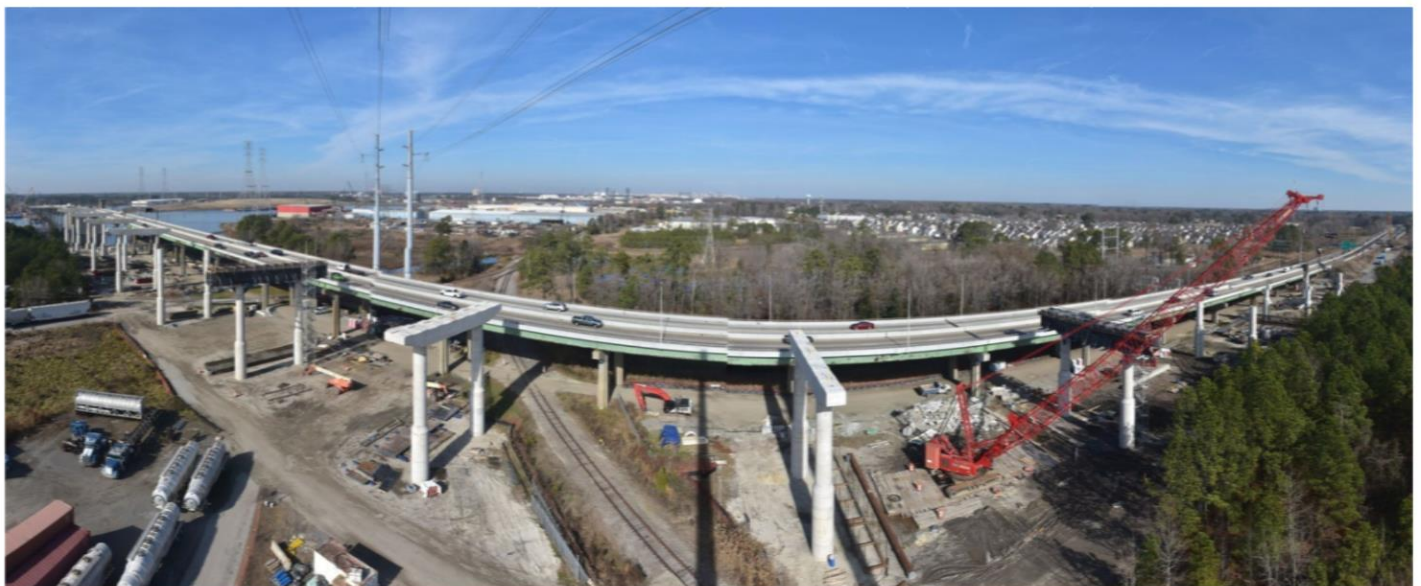
HRB (Panoramic View)