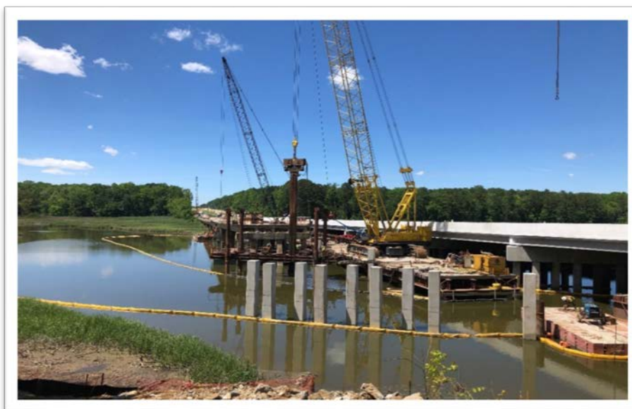
Pile construction for the new EB I-64 bridge over Queens Creek (Looking West)