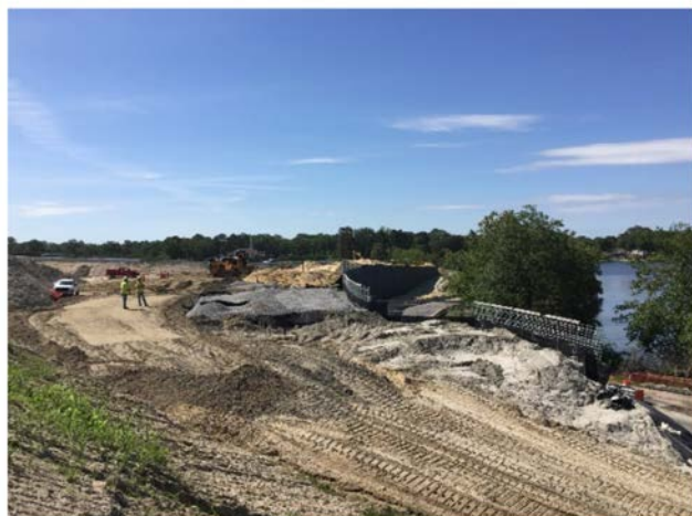
Future I-264 Ramp to Witchduck Road (Kemps Lake on right)