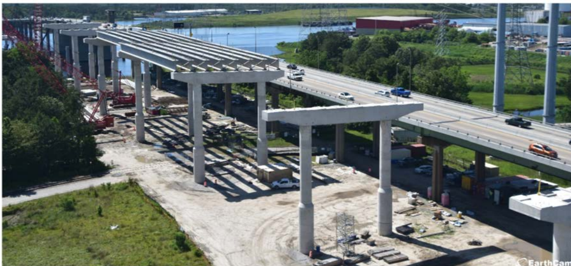
HRB – Piers 19-25 (Looking West)