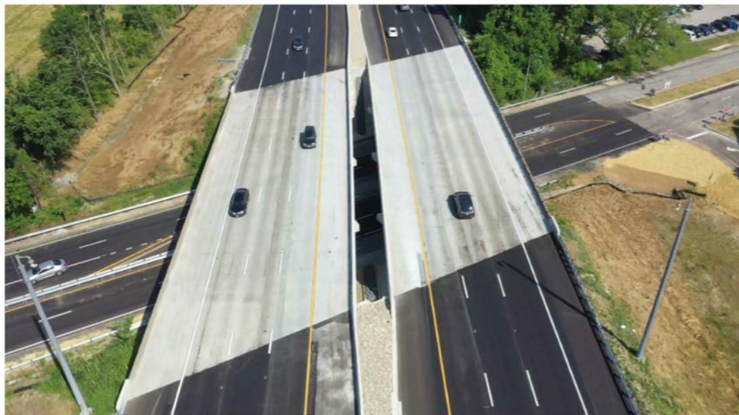
Project Site (Looking West from the Yorktown Road overpass)